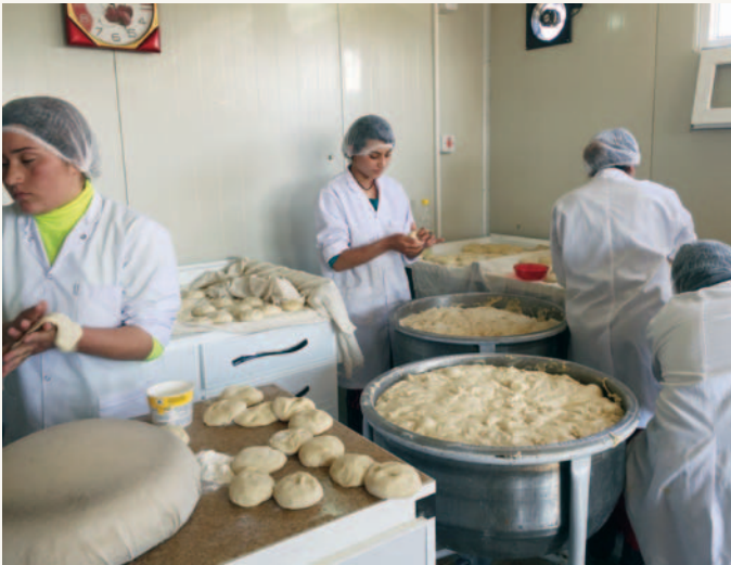
Bread bakery in Yazidi resettlement camp