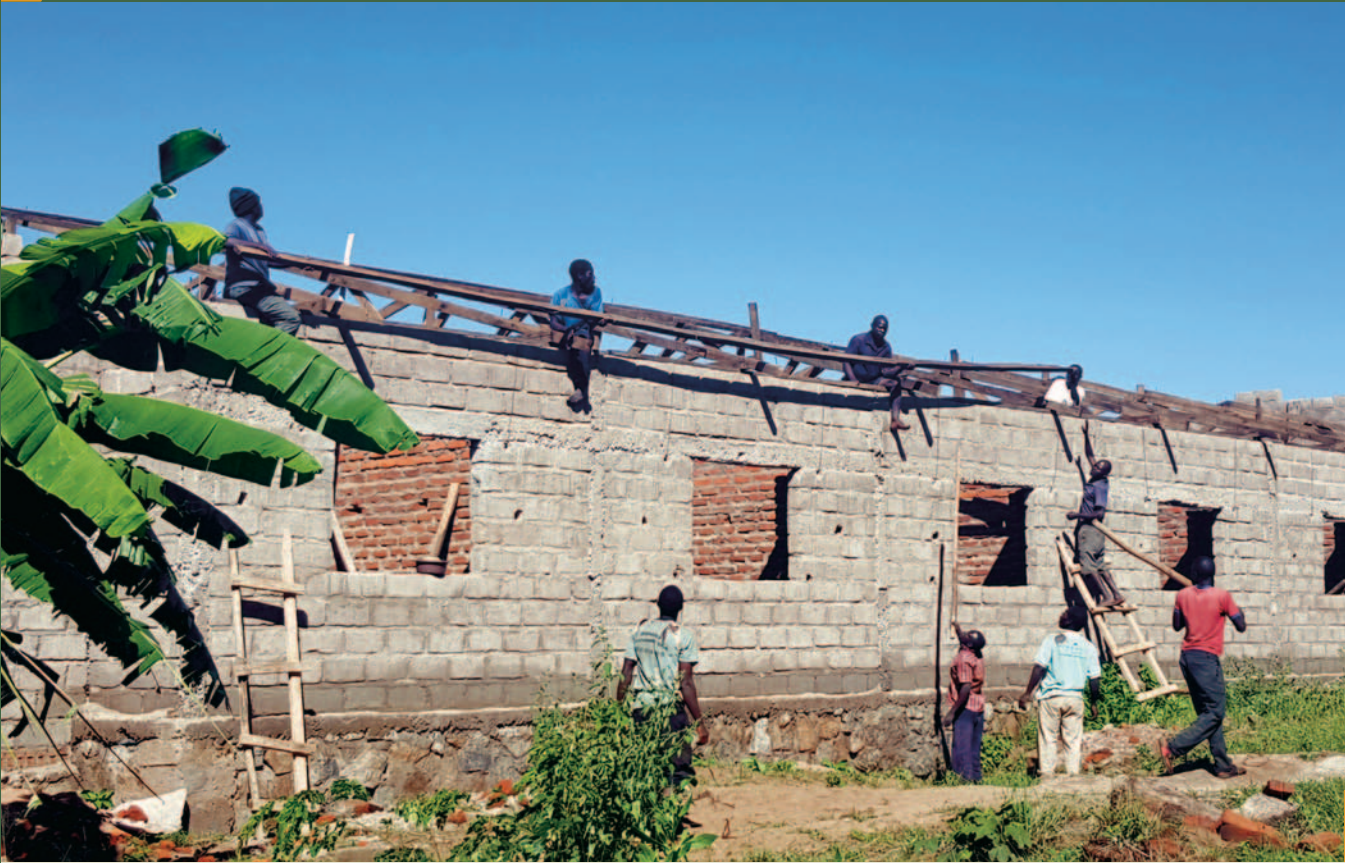
Roofing is underway on the Leadership Training Center in Tete!