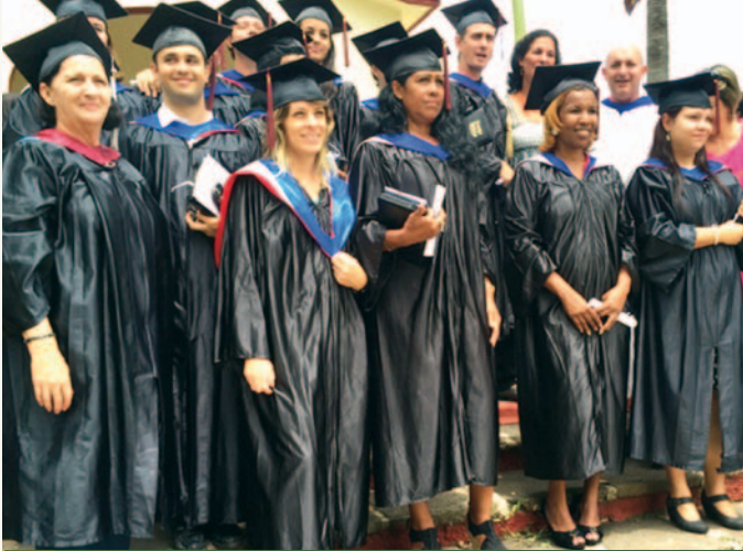
Graduation at Matanzas Evangelical Theological Seminary in Cuba

Read more about these and our other partner ministries at www.theoutreachfoundation.org . And, thank you for being our partner in helping share the Gospel in word and deed. 🌍