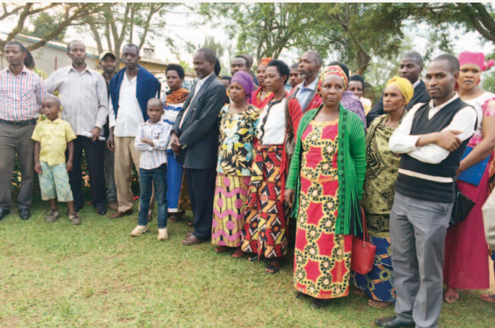
Members of the Light Group

O fficials in Rwanda recently shared “official” numbers: 1,074,017 Tutsi and moderate Hutu were brutally killed in the one hundred days of genocide in 1994, leaving behind hundreds of thousands of orphans, widows, widowers, and people with disabilities. It's nearly unthinkable how such an atrocity could happen in modern times. And, it's hard to imagine how Rwandans could ever heal from the ordeal.