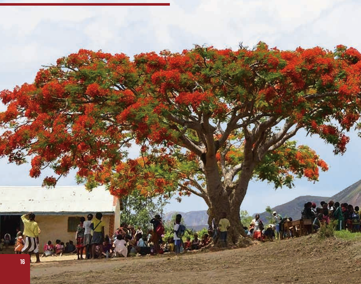
A flamboyant tree, one of Madagascar's tree ambassadors to other parts of the tropics

This Christmas, you can help plant native trees and fruit trees at schools and churches in Madagascar; produce grafted mangos and other fruit trees to help low-income farmers get their families out of poverty; produce and plant fast-growing trees to provide needed fuelwood and construction wood. Your $50 gift will provide 5 trees, from production through planting at a church or school.