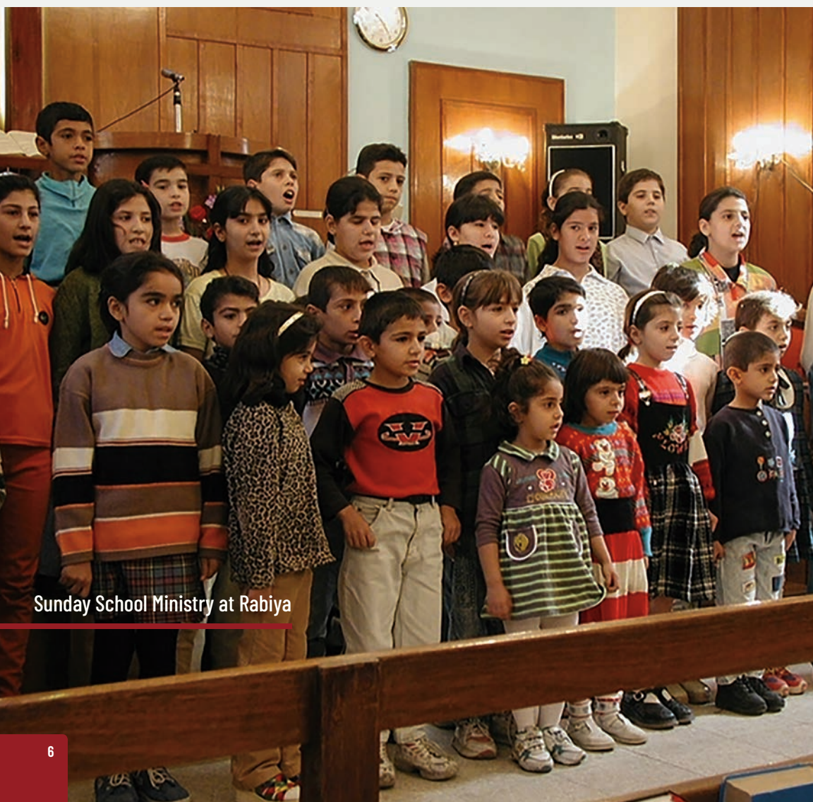
Sunday School Ministry at Rabiya