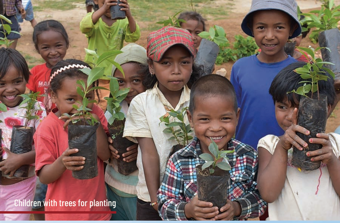
Children with trees for planting