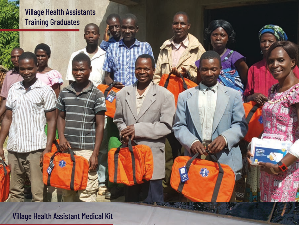
Village Health Assistant Medical Kit