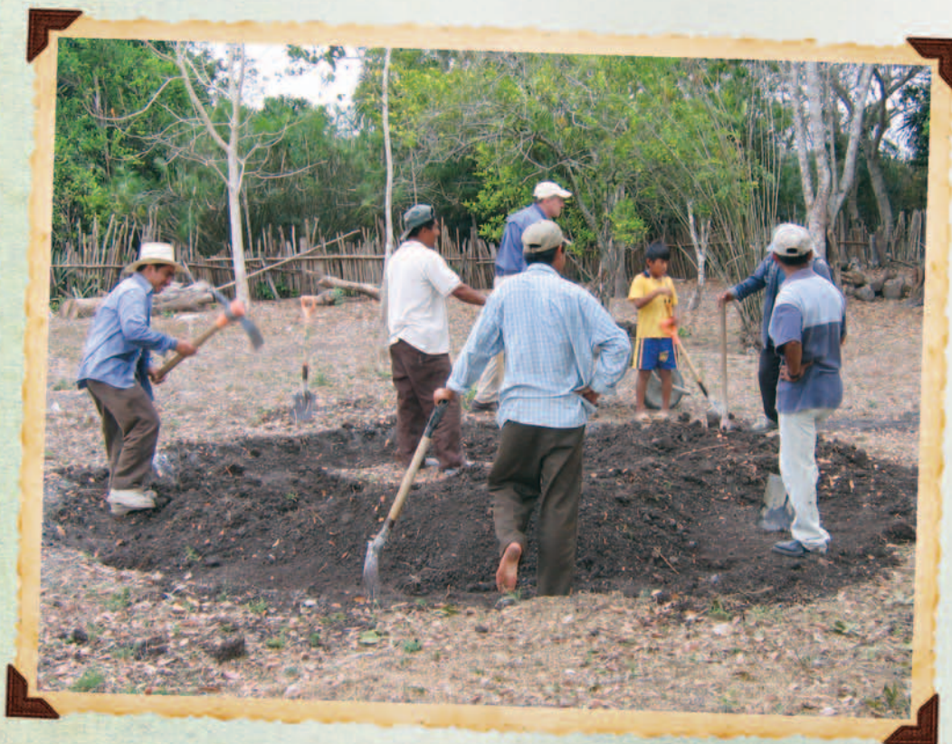
Fresh water cistern in Mexico

The Outreach Foundation is honored to connect our donor partners with our global partners. Despite our differences, when God's people join together, the church is built up for God's mission around the world. We learn from each other and are better equipped to share and show God's love, in our neighborhoods and to the ends of the earth.