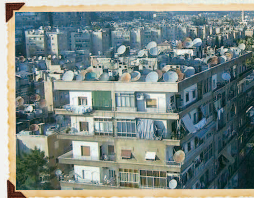
^ Illegal satellite dishes in Tehran, Iran

Friend: "But don't Islamic leaders control all aspects of life in Iran?"