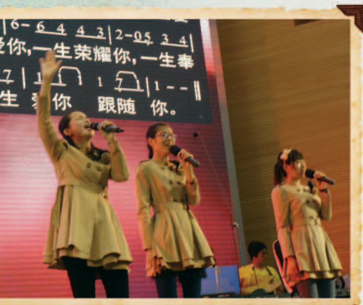
⌒ Worship in China

“ C apacity-building” is a popular phrase today in discussions about mission and economic development. Some describe it as the difference between giving a man a fish and teaching him how to fish.