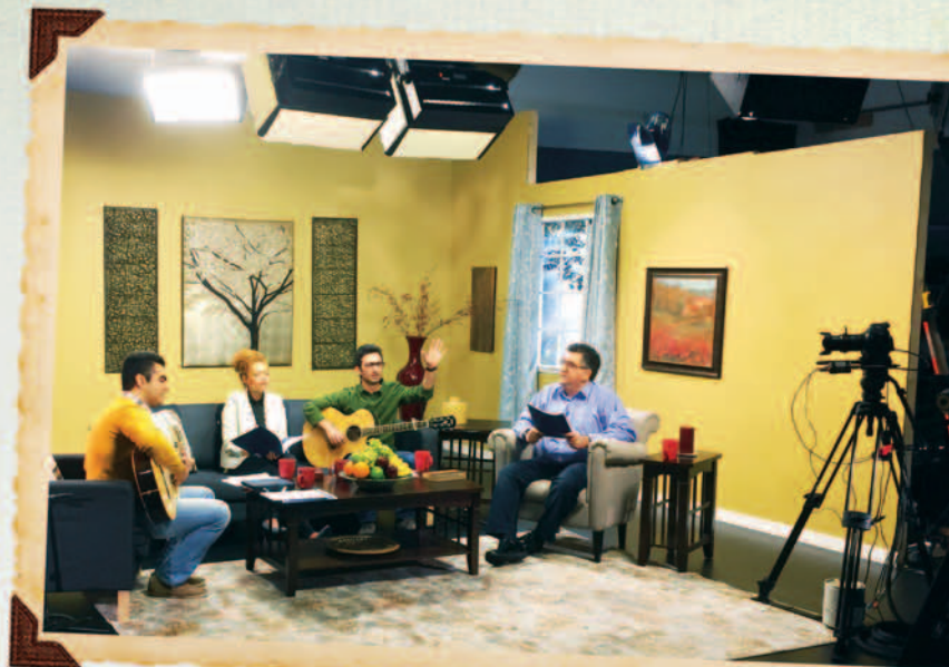
^ Recording an episode of the house church programs. At least 60 house churches have been formed since the series began.

Outreach: "You'd be amazed at Iranians' ingenuity. Christian satellite TV is very popular in Iran – even though satellite TV dishes are illegal! We're involved in production of some Christian programming. In fact, there was a series recently broadcast about establishing house churches. Our sources inside Iran report that since that series was broadcast, 60 new house churches have been formed. And, demand for Bibles in Iran is at an all-time high. We're also providing theological training for Iranian Christian leaders."