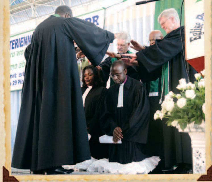
^ Installation in Rwanda

The Outreach Foundation currently manages six endowed funds: The Outreach General Endowment Fund; Flowers Chair of Biblical Studies (San Pablo Theological Seminary, Merida, Mexico); McCall Endowment Fund for Mission in China; Rose Chair of New Testament Theology (Justo Mwale Theological University College, Lusaka, Zambia); Warlick Chair of Evangelism (Justo Mwale Theological University College); and the Larsen Endowment Fund for Children's Education in Africa.