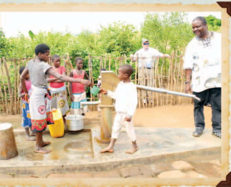
⌒ Clean water well in Mozambique